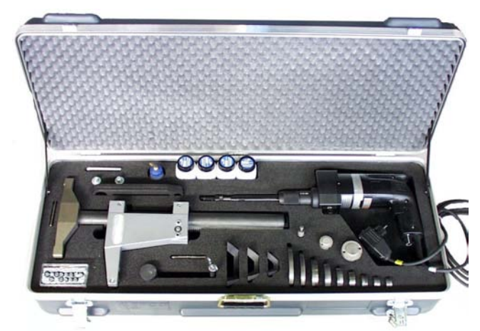
VALVA-1 machine case

The VALVA machines, as do all EFCO products, provide a complete repair system.