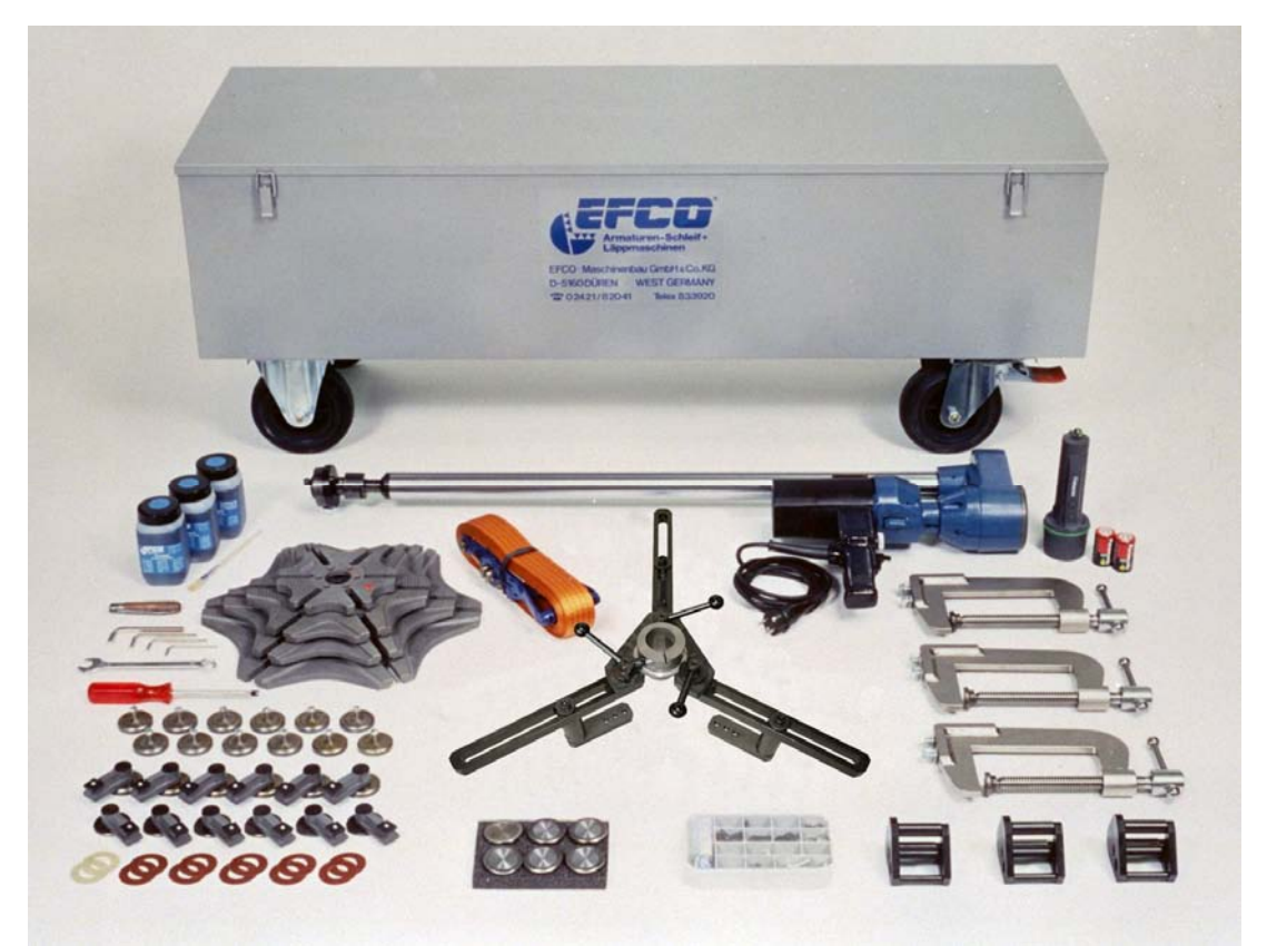
VALVA-2 with workshop trolley