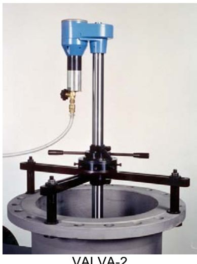
VALVA-2 with 3-point centre clamping