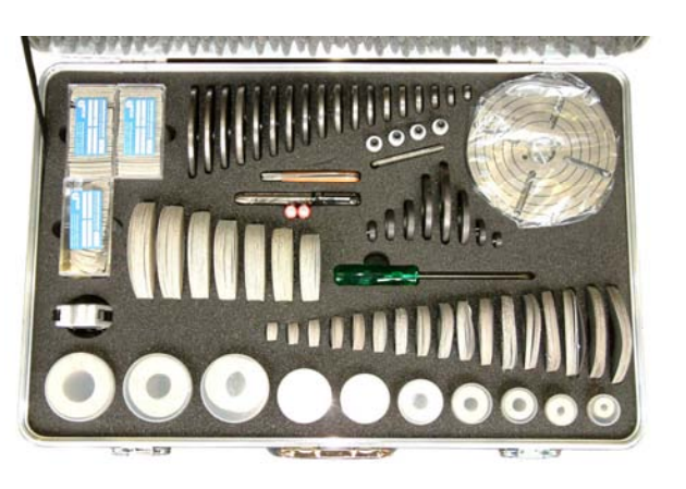
VALVA-1 accessory case