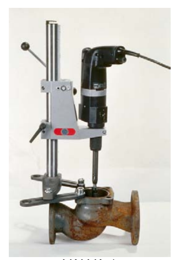
VALVA-1 with machine stand